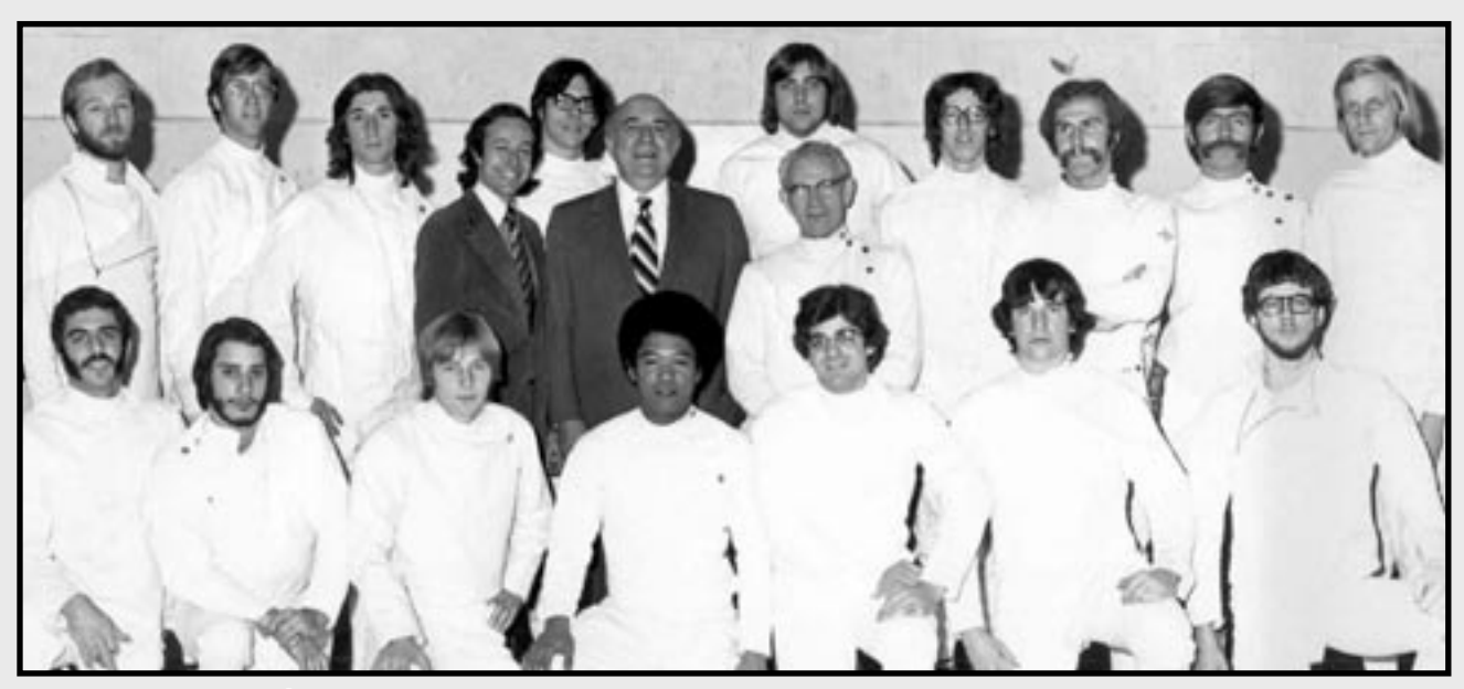
NYU's 1973-74 NCAA CHAMPIONSHIP TEAM