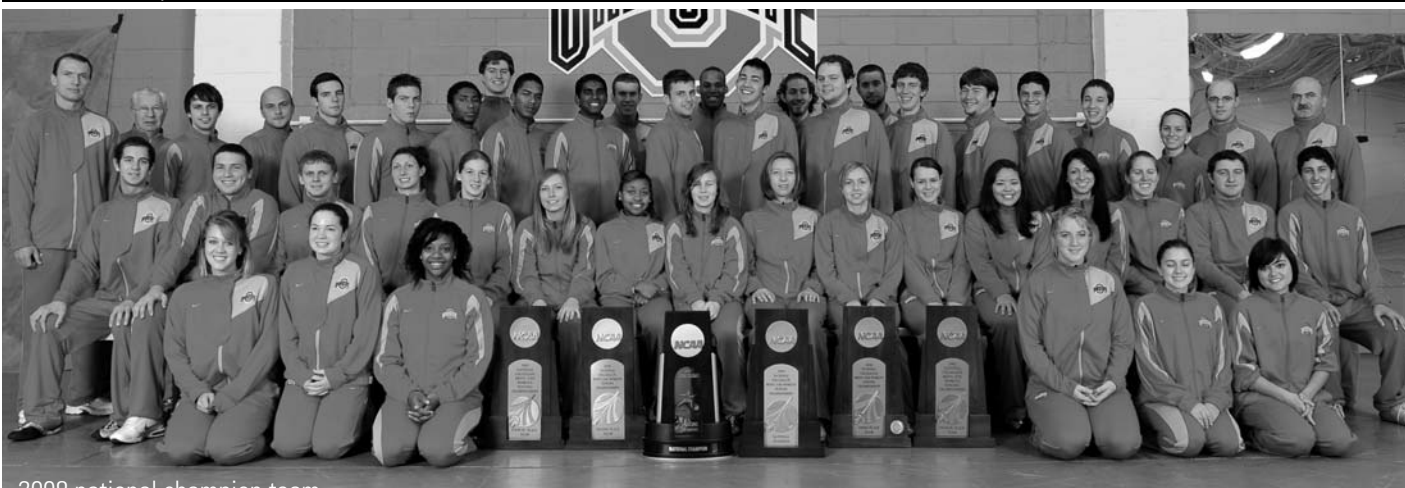
2008 national champion team